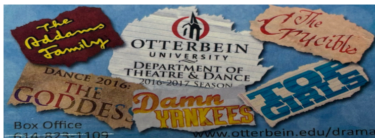
<-- cover of my new favorite notebook

Things To Do: • Dolly hologram? • as speech (ig) is happening • rolling on floor • Dolly INTRO!!! • BARN!!! • Tenor center rolling on grand • Liam on skateboard • clock dance