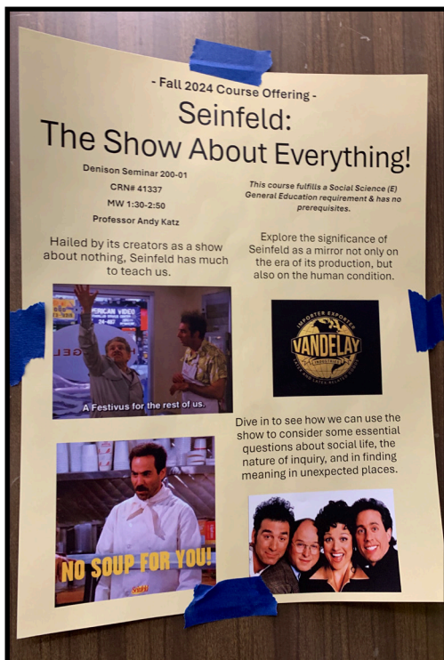
The Seinfeld course in question

And for all the haters and skeptics who think there is nothing academic to discuss about the sitcom medium, please observe my list of other possible sitcom inspired classes: