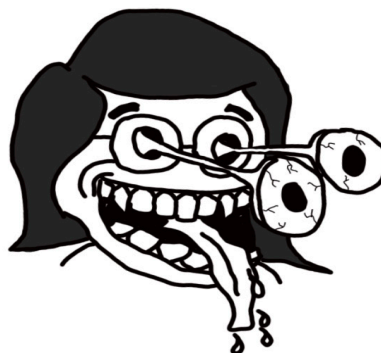
Me with a BLT Sandwich