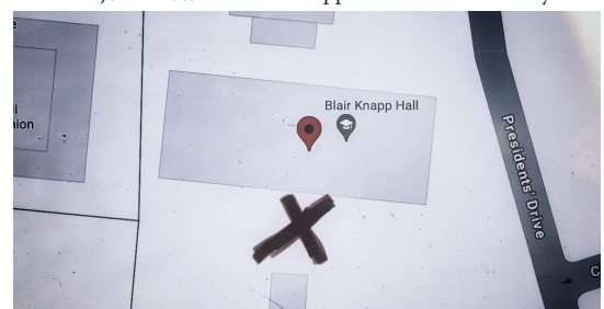
University Treasure Map, 1836