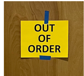
Knapp Bathrooms Currently