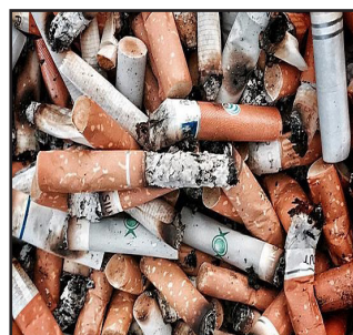
Campus smoking problem