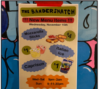
Bandersnatch new menu items