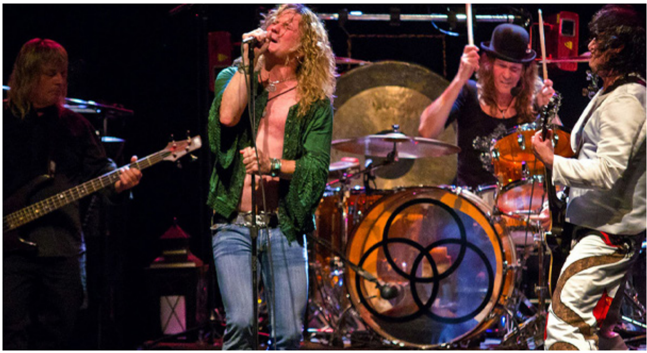
Kashmir, the Live Led Zeppelin Show performing in 2020.