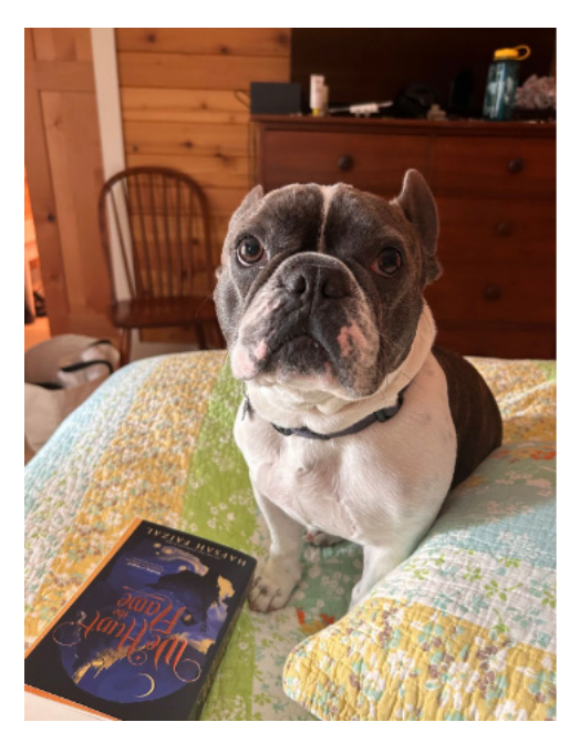
This phot is from last summer. He is 4 years old now.

A year ago he got an infection so had to wear the donut.