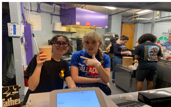
CA and BG fight tirelessly for the kitchen's honor. The unsung heros of the night.