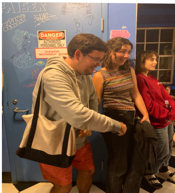
SG and GC enjoy the sweet, sweet, musings of all the bands at this years Septemberfest (I remember what band was playing at this point, I just don't want to tell you).