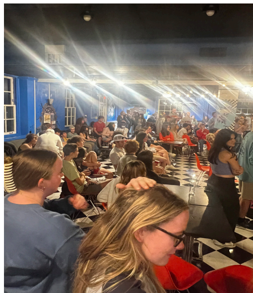
The lights got wild out there