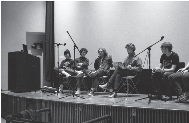
No matter the political spectrum, everyone is united by 75% wash denim.