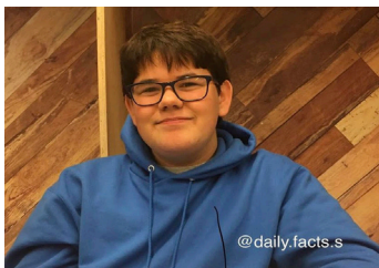
This young man wheres glasses that date back to 12th century china