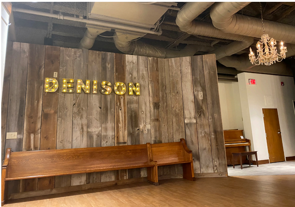
Enjoy this photo I took of the corner (if you did not know what I was referring to)

So it is clear that I have many questions about this area. That being said, it doesn't mean that I totally dislike this area. It is cute and niche and obscure, just like Denison and its student body. I just find it so random. The best word to describe this area of Slayter's third floor is obscure. It is the most funky and purposeless area of this campus, therefore I love it. I would love to hear other people's thoughts on this space: either kik us or connect with us on linkedin to do so.