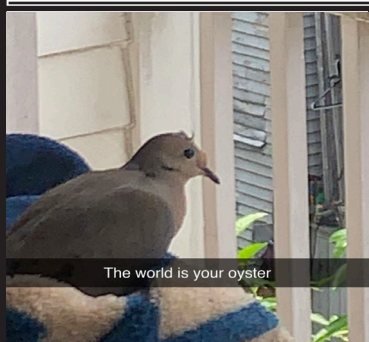
The world is your oyster