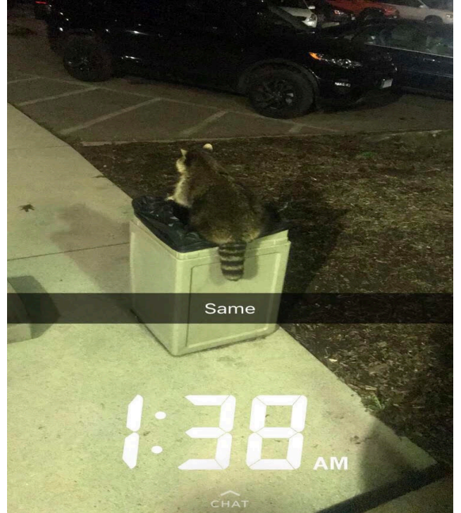
3. the raccoon outside of crawford that kinda gets it