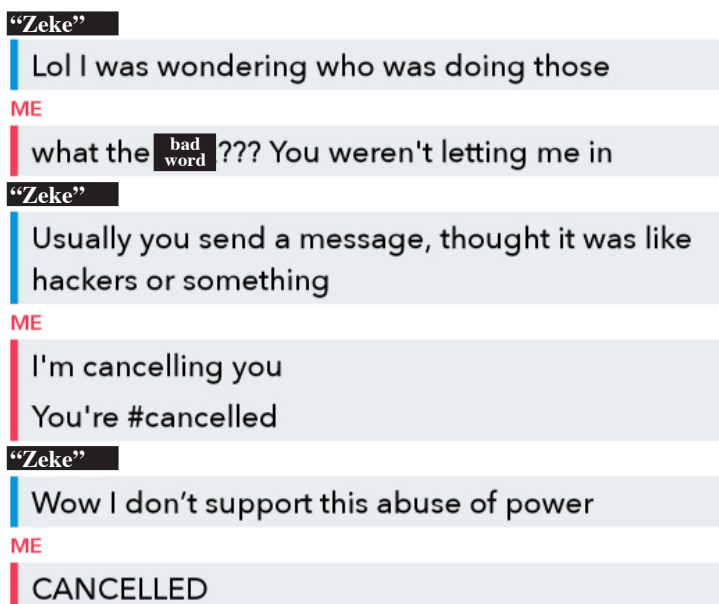
Pictured: A chat log between a head member of Bullsheet staff and myself in which said member of staff openly admits to seeing and ignoring my desperate pushes for help. Readers, is this a suppression of my 1st Amendment rights? You decide: The options are Yes and Guillotine

*NOTE: The Bullsheet has not actually won any of these awards. How could it, with management like this?