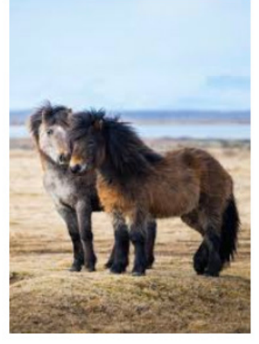
The Icelandic horse is a big fluffy boy