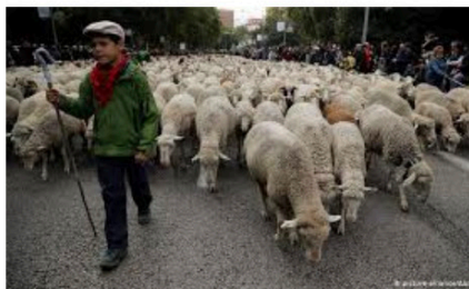
Icelandic forces prepare to combat the British invasion. 1940, colorized

Don't go into STEM, you can be electrocuted. Be a fisherman instead, much safer.