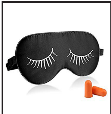
eye-mask and ear plugs to block out all scary news/twitter/media that isn't Netflix's Love is Blind