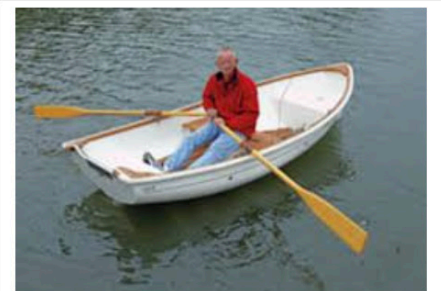
Ole' Sassafras, the pride and Joy of the Icelandic Coast Guard