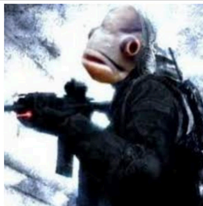
Iceland when the U.K. tries to steal its Cod-fish