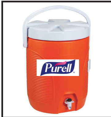
3 gallon cooler of hand sanitizer, just to be safe