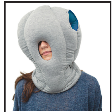
ostrich pillow for maximum comfort during self-quarantines/stress naps/ the inevitable shift to online classes