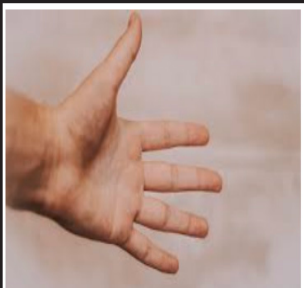
Lanval’s girlfriend who “goes to another school”

Lanval, who is an honorable man, reject’s Guinevere’s advances, to which Guinevere says, and I quote “ur gay”—classic middle-school comeback that. Lanval goes and pulls the good ole Uno reverse card, and is all like “shut up, I have a girlfriend and she’s hotter than you, she just goes to another school.” Whelp, looks like Lanval just got filed for breach of contract because mystery lady completely ghosts him.