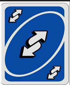
Guinevere gets UNO reverse carded, and she does not like it one bit.

So Lanval is chilling with his homie z’s in Carduel, and Arthur is like “happy Pentecost everybody, come get some free presents”, but surprise, surprise, good ole Lanval gets absolutely nothing.