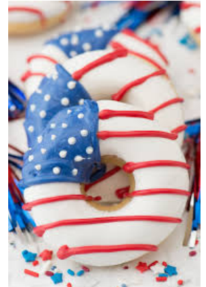
tastes like engaged citizenship

How to celebrate? It's easy! Head over to your nearest seller of baked goods, and pick up a dozen. Or be a lil naughty and treat yourself to a baker's dozen. I won't tell anyone, teehee! And hey, maybe on the way you could take a teensy tiny detour to your nearest polling place, just for funsies! I hear there's one at the Presbyterian Church at 110 W Broadway Granville OH, 43023! Wowie—isn't that crazy convenient? It's almost so simple that it would be so silly, even irresponsible not to! And then after that, you can eat your donut with the satisfasction that you contributed in a crucial way to democratic society! Yummy!