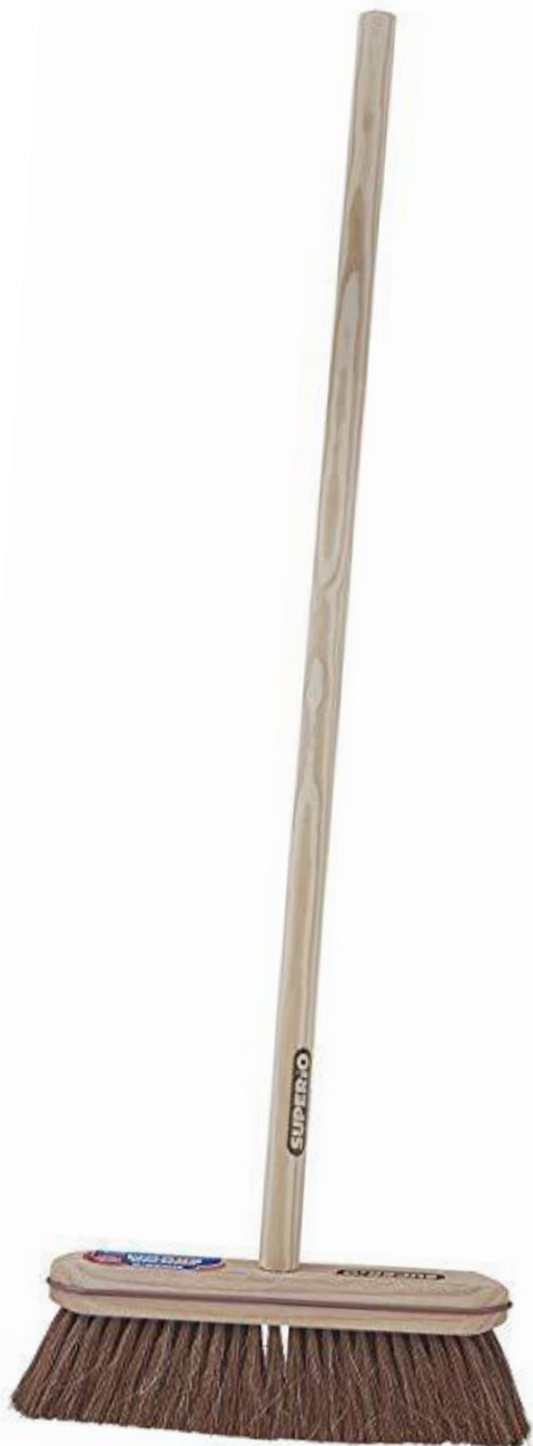
Picture shows general design of the broom

I used this broom for The Rocky Horror Picture Show on November 2nd in the Slayter Auditorium. I forgot it and it is now missing.