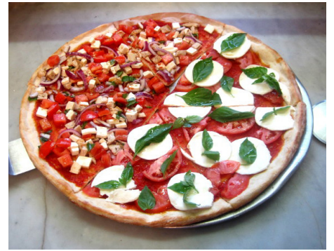
kinda odd lookin' but still infinitely superior to an anchovy