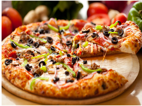
a pizza worthy of love and affection

For members of the latter party—rejoice! Today is our day. Together we stand, strong, united, for a better world.