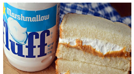
this is actually white culture