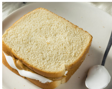
it's just so.....devoid