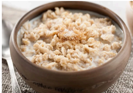
please say sike. this looks like something an oliver twist-era street orphan in an all-grey outfit would eat