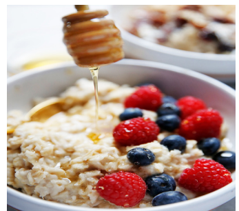
this one's slightly better, but critically—it's still not a pancake. please love yourselves. eat a pancake.