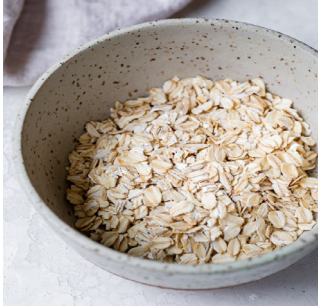
are people really eating this, like in real life?

I really hope y'all weren't looking for more than that. It's oatmeal. I genuinely have funny nothing to say here. If you're reading this Mom, I know you must be excited about this holiday, so this one's for you. Also—LET'S GO CHICAGO TEACHER'S STRIKE!! In the immortal words of Chance the Rapper, "I fully support you." Sorry Lori Lightfoot. Maybe you can treat yourself to a nice piping bowl of oats, and workers rights.