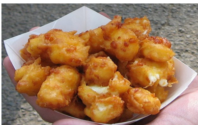
just look at the cheese curds

ALRIGHT, sorry about that! Nothing to worry about—she was just concerned that I would forget to remind you to make sure to pick up a dipping sauce of your choice for your cheese curds. Ha, as if! Who could forget about dipping sauce? It's National Cheese Curd Day, after all!