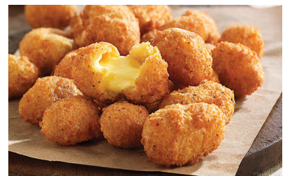
let's just focus on cheese curds. please, just cheese curds. I'm begging you